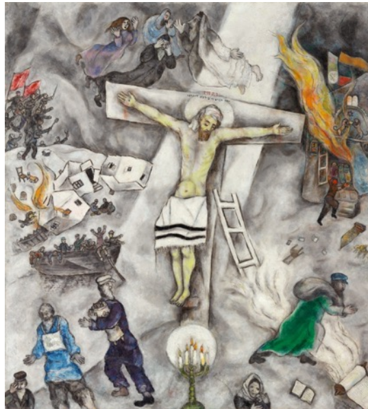
White Crucifixion 1938 by Mark Chagall