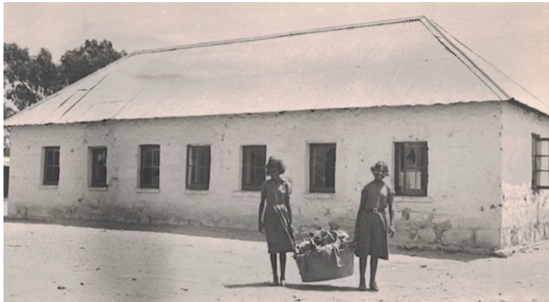
Washing Day at the Bungalow, 1934

In the 1930s and 40s those kids swam in this water hole.